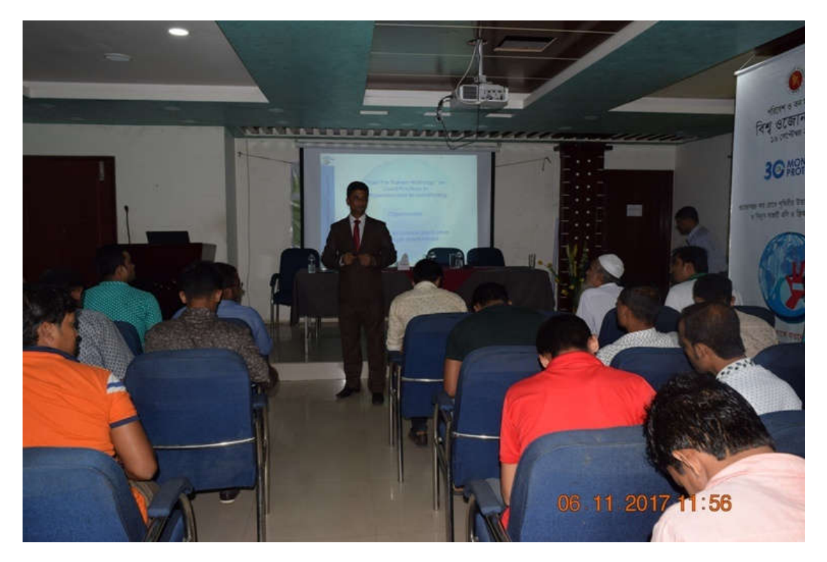
Technical session of the training workshop